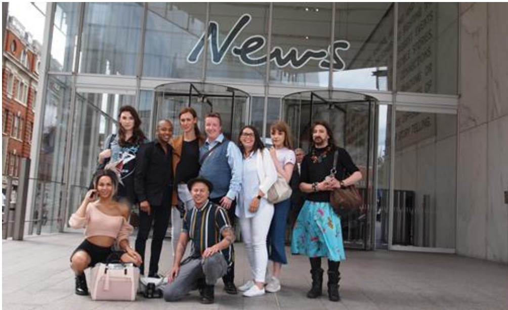
All About Trans group outside The Sun

"I have more confidence that my knowledge and story is useful and can be useful in persuading media organisations that they have the power to create change that's potentially life-saving." All About Trans training course participant