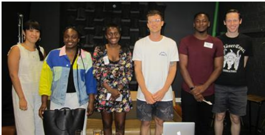
Media Movers group at VICE

We have held three monthly peer support sessions since August, giving the group the opportunity to share learning, challenges and tips for engaging with the media. We brought in one of our Angles members to co-facilitate the first session on preparing for interactions. Sessions have also included a Coram representative attending to speak about the legal side of keeping yourself safe in the media, and a content creation workshop run by an All About Trans member.