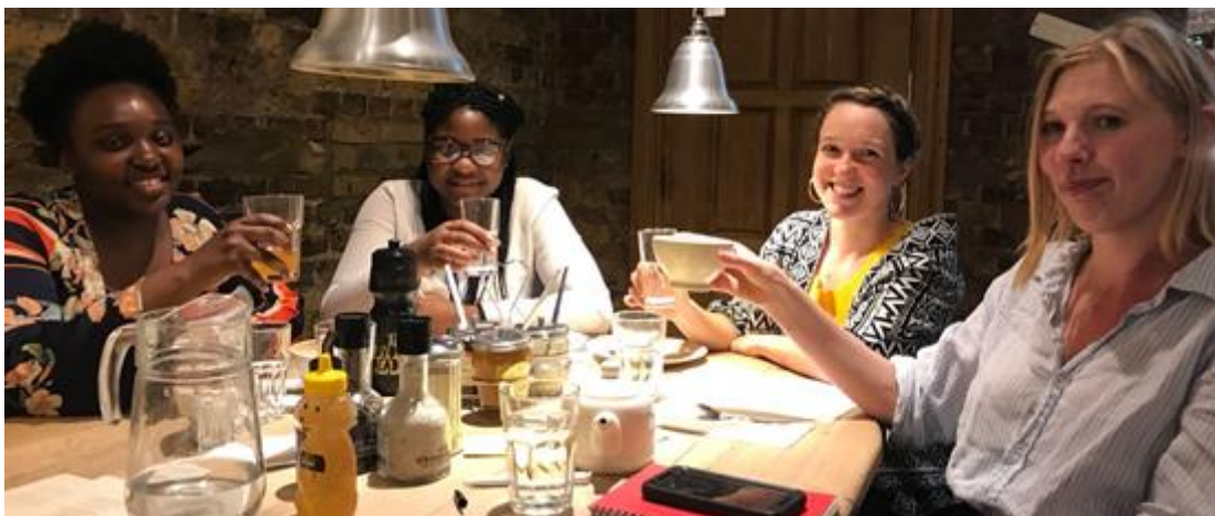
Media Movers after interaction with Metro