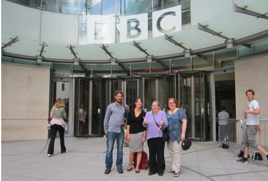
Talking About Poverty group outside BBC