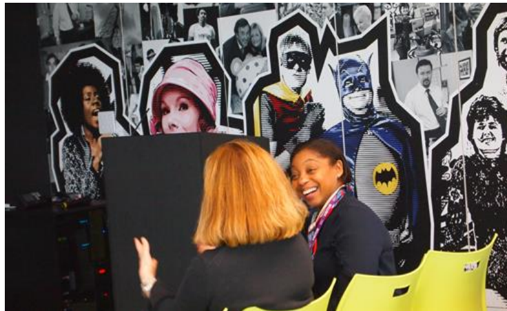
Angles interaction at CBBC

Others have been delivering workshops on activism and drama for The Roundhouse, Camden. They have received coverage in print media and been involved in a Radio 4 documentary about consent with Jameela Jamil, supporting each other during the media opportunities.