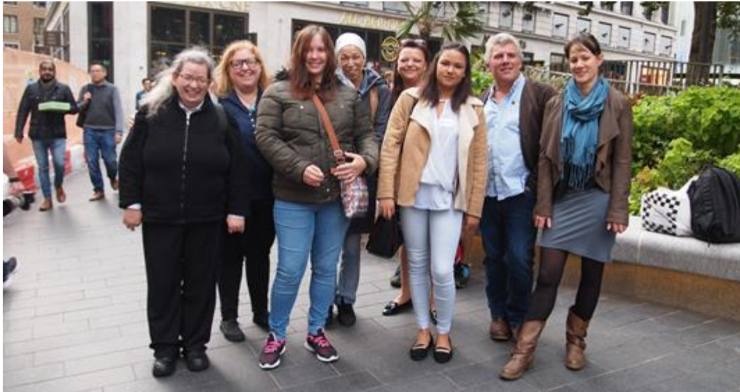
Talking About Poverty group after Cosmopolitan interaction

Central to On Road's work across all our projects is the work of moving journalists on an emotional and human level through conversation and mutual understanding. Since the project kicked off, we've held 5 informal and friendly interactions with 18 senior media professionals.