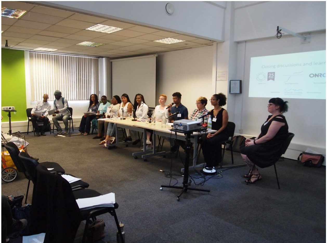
Facilitators at the Trust for London event

“I felt very supported through people holding the planning process, which allowed us to be involved and to shape the event without having to ‘do everything by ourselves’. Going forward this feels like exactly what I need – strong allies who are encouraging us and share their knowledge and skills.”